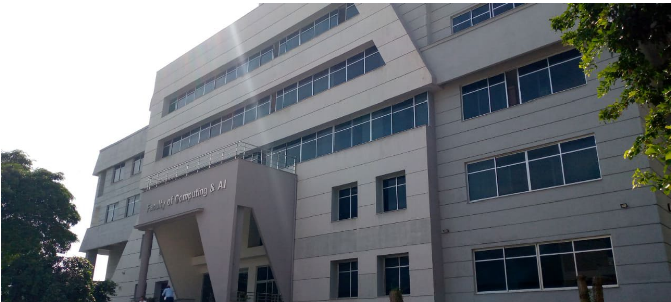
Buildings are Designed and constructed to avail Full Ventilation and Sun Light naturally through very well orientation.