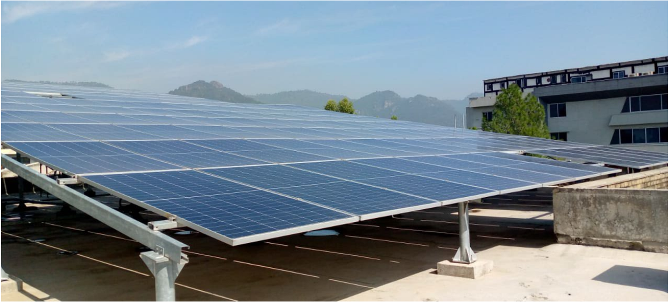
230Kva Solar Energy System

with inverter technology, in passed manner. Air Conditioners which is more energy efficient, low voltage consumption in all weather conditions.