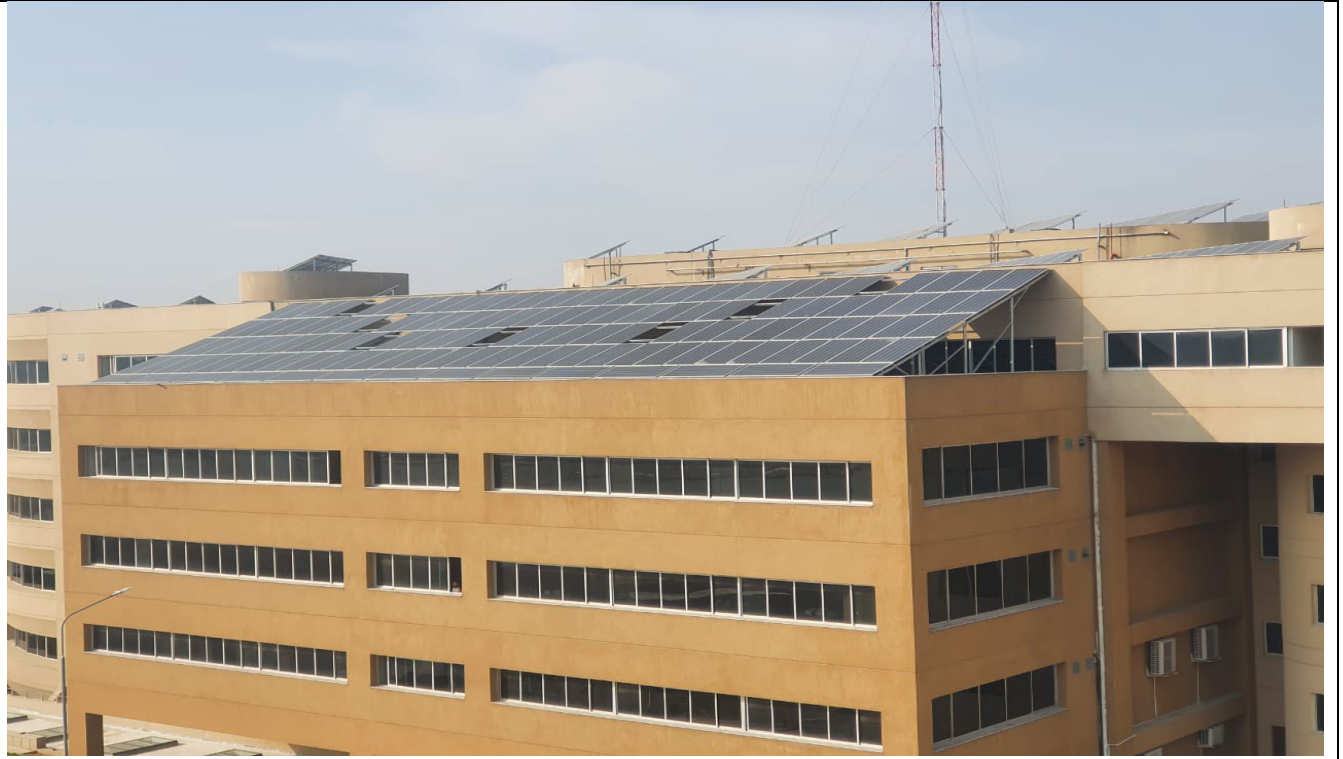
Installed Solar System at AUAACK