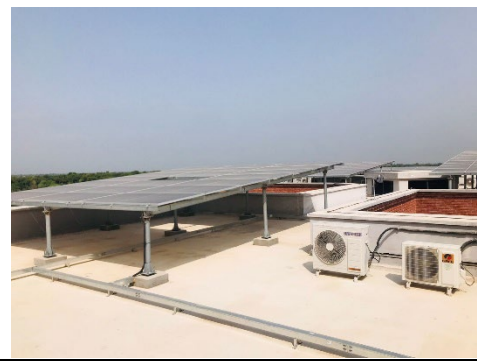
Solar Plates installed at Air University Multan Campus