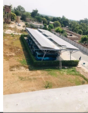
Solar Plates are installed on Roof Top of Buses Shed