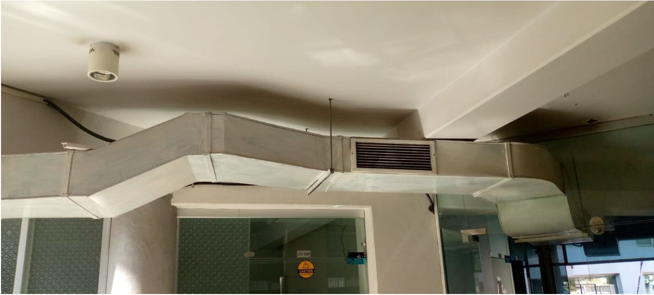
Exhaust Duct System install inside the building