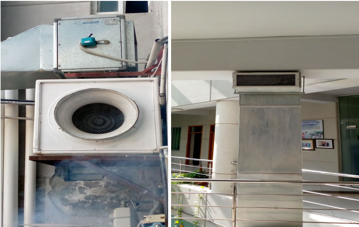
A 2500CFM Fresh air and Exhaust System are installed at Building